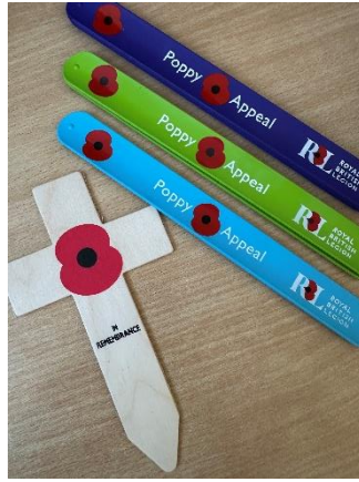
Items = £1

From Monday 3 rd November children can bring cash in for: