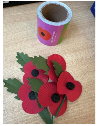
Items = 20p