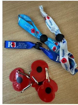
Items = 50p