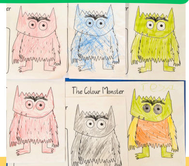
Hopper class: Colour monster artwork