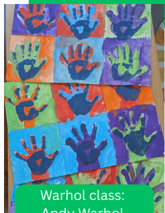
Warhol class: Andy Warhol inspired art work