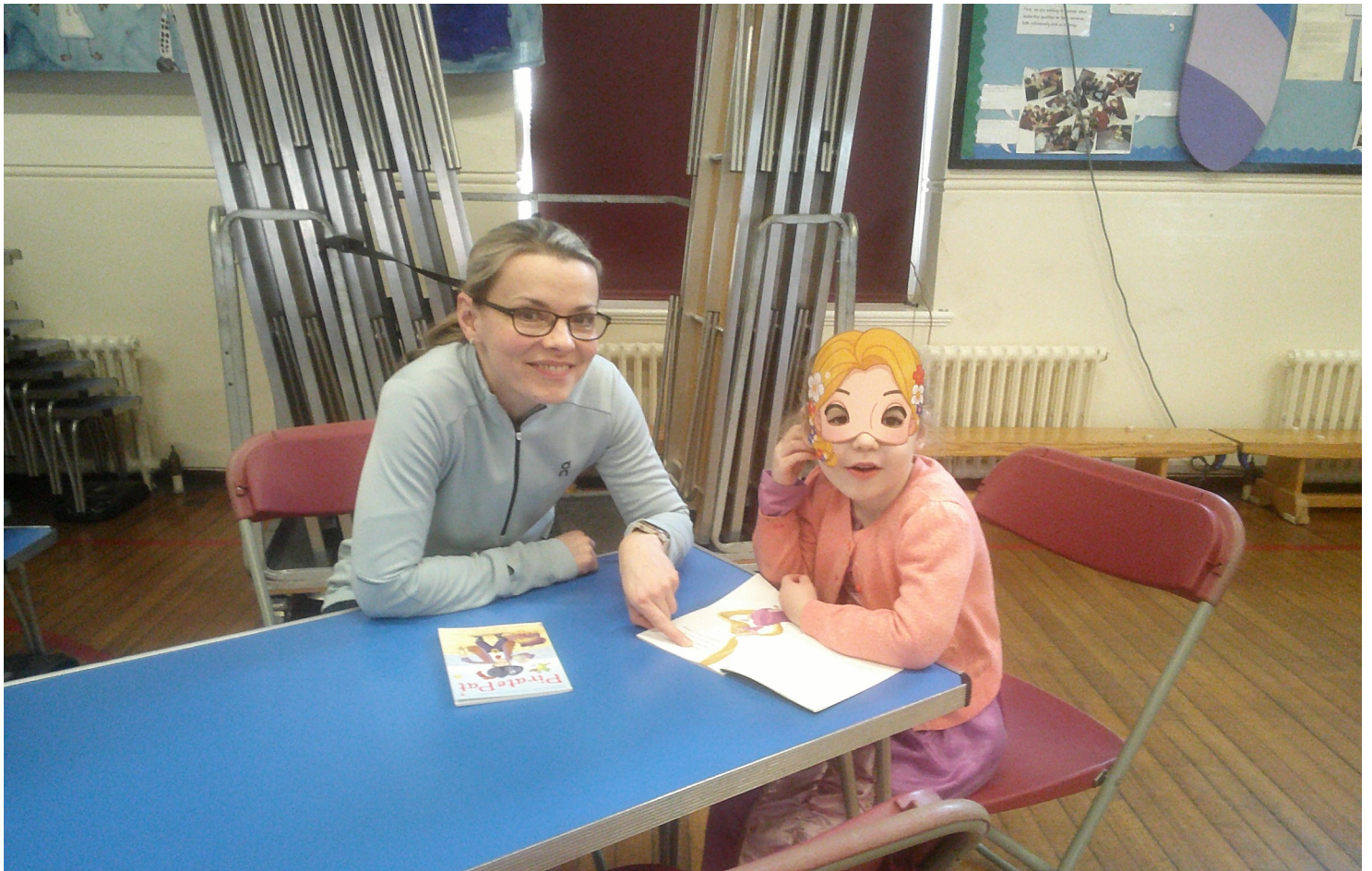
Walk to School Day 2