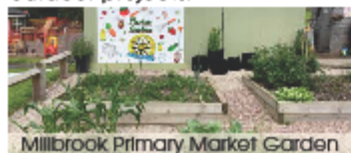
Millbrook Primary Market Garden

This is a great time of year to showcase your school's garden, wildlife area, allotment or other environmental initiatives and outdoor projects.