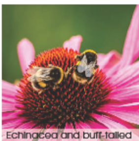
Echinacea and buff-tailed

In Britain we have only one species of honey bee, but around 270 species of other bee! They are wild and many live solitary lives. This year we are following the: Buff-tailed Bumblebee, Bombus terrestris . More info here.