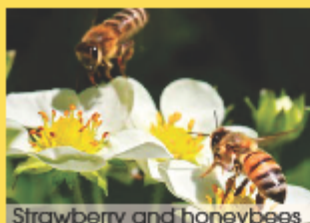
Strawberry and honeybees