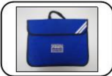
A small book bag: £5.00