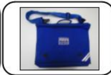
A large book bag: £7.00