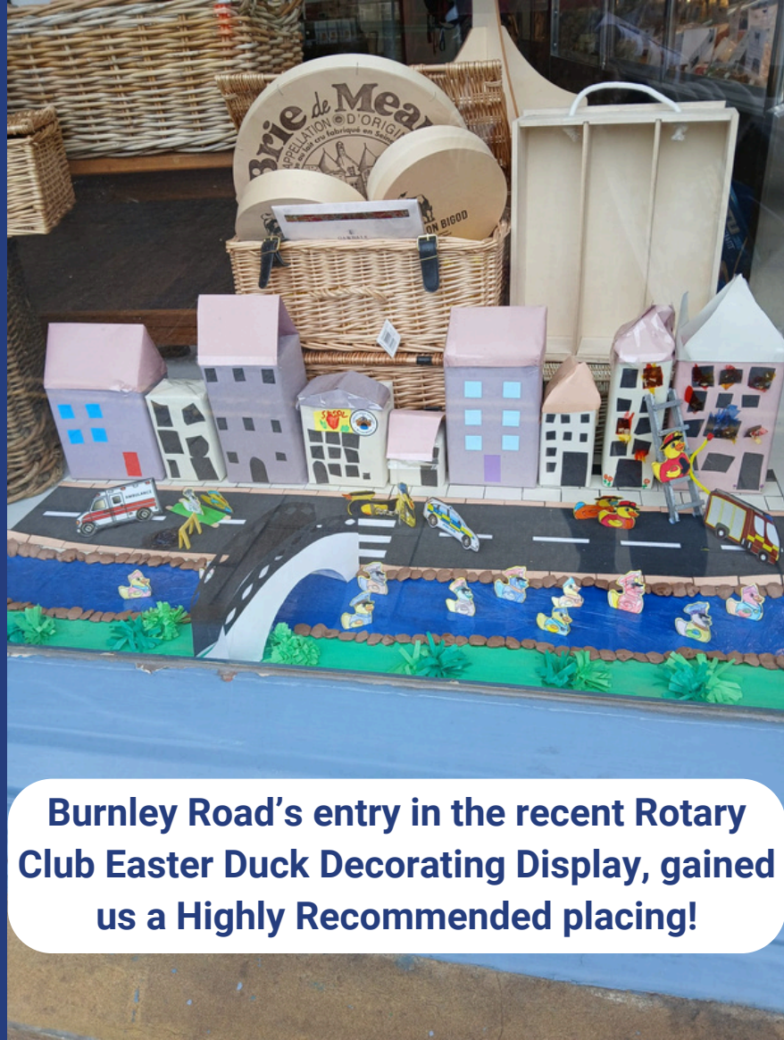
Burnley Road's entry in the recent Rotary Club Easter Duck Decorating Display, gained us a Highly Recommended placing!