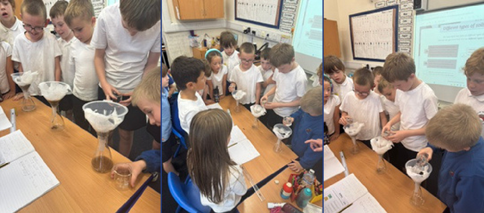
As part of their Science module Year 3 were testing the permeability of differing soil types.