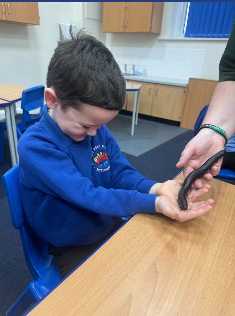
Wild Science visit Burnley Road