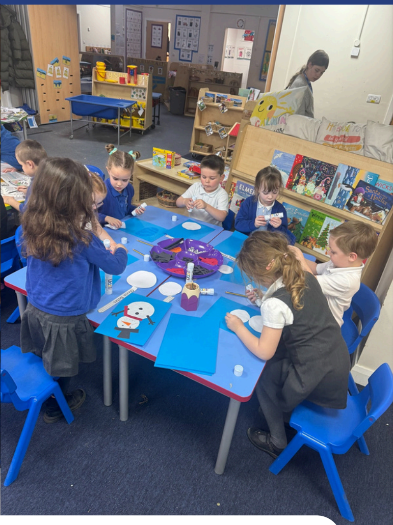
The children in Reception and Year 1 had a great crafts afternoon on Monday, where they made polar bears, snowmen and snowflakes!