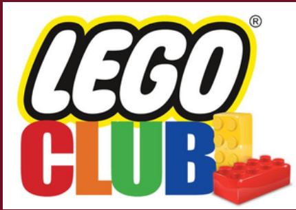
LEGO Club – External Provider (Tuesday)

Unlocking Potential, Nurturing Excellence