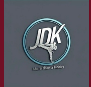
Karate Club – External Provider (Tuesday)