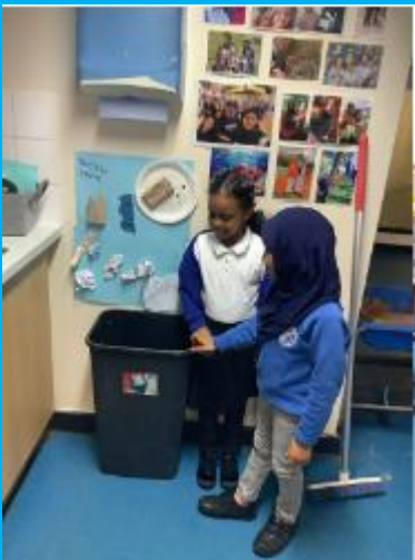
Early years love Planet Earth!

In Donaldson class, we learnt that recycling is turning rubbish into something new. As a class, we thought of ways to recycle and how to protect our planet earth. We had so many lovely ideas. We decided to make kites and a bug hotel by using plastic bags and plastic bottles. We also created a poster to encourage adults and children to recycle more.