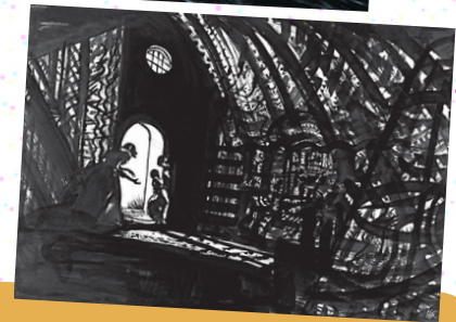
Hansel & Gretel