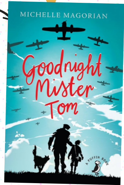
Goodnight Mister Tom

Handwriting - Kinetic Letters Spelling - Focus is on Year 5/6 Spelling Words and rules