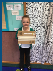
Year 1 have been making cars in DT.