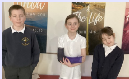
Celebrations Photo Wall