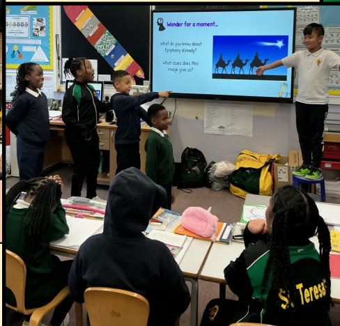
Year 3 Role play during RE lesson.