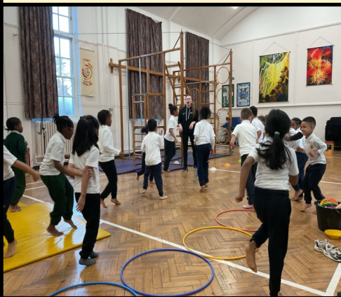
Year 1 PE Lesson, Gymnastics.