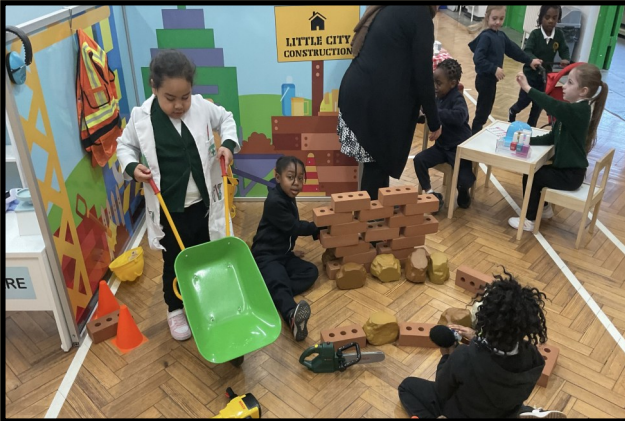
Reception during their Little City Role Play Session

Below is a selection of some of our learning this week.