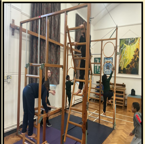
Year 2 Gymnastic Lesson