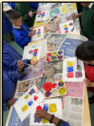
Year 1 Art Lesson