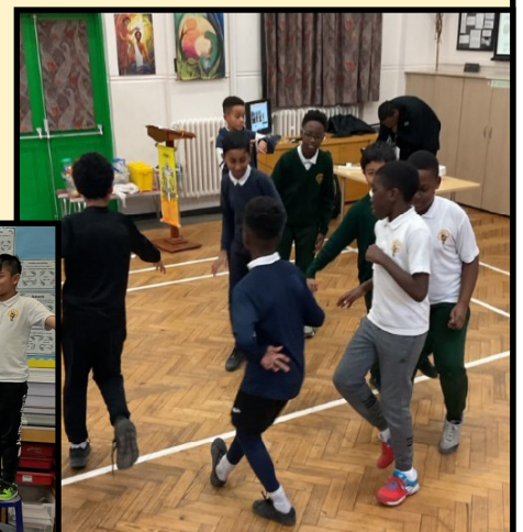
Year 6 Dance in PE