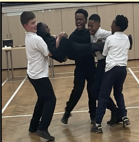
Year 5 Dance lesson for PE!