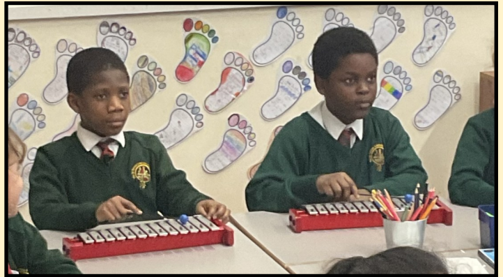
Year 4 performing on their Xylophones.