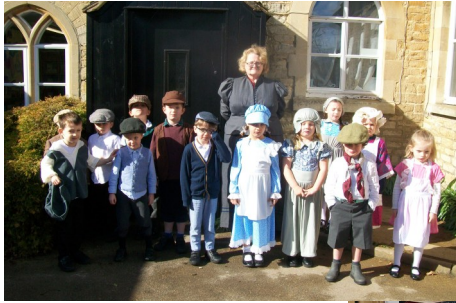
Unsmiling Victorian children!

Ruby had a fabulous Victorian School experience on Wednesday. Not only did they look the part, they also wrote their letters with ink pens, took part in drill and played some traditional Victorian games.