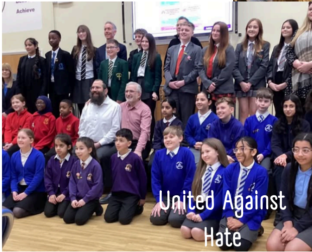
United Against Hate