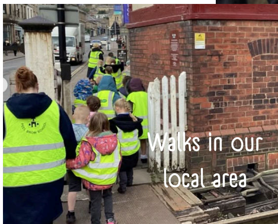
Walks in our local area