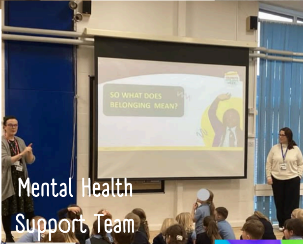
Mental Health Support Team