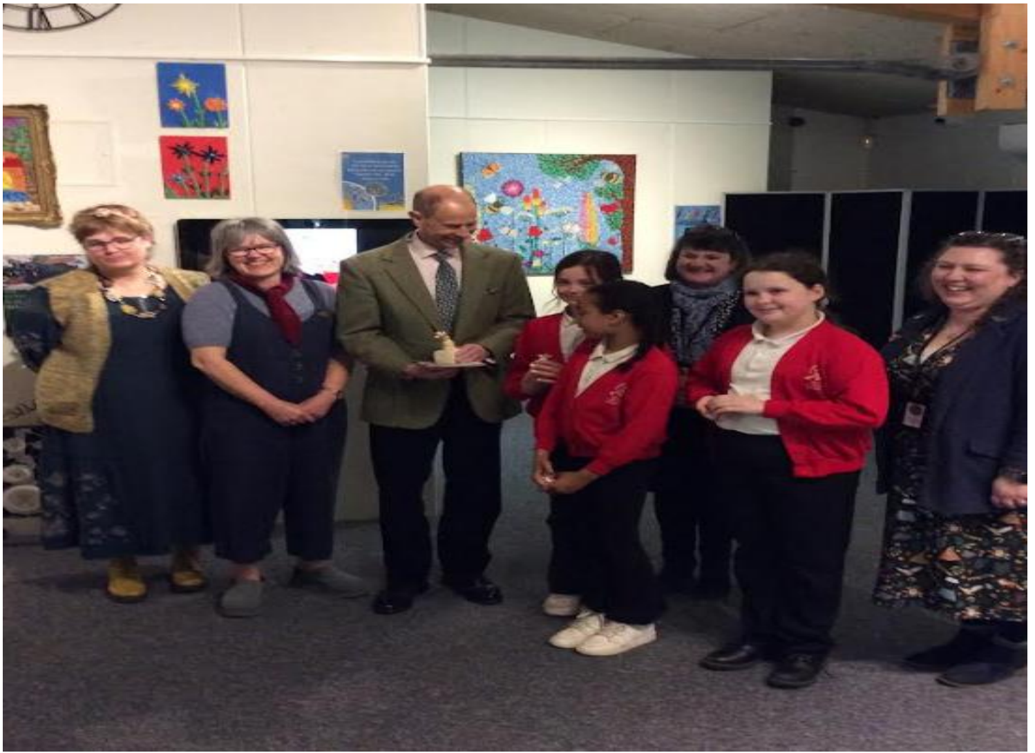
Meeting HRH Prince Edward at Brading Roman Villa