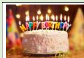
Jasper L - 10 th May

We wish these children a very happy birthday