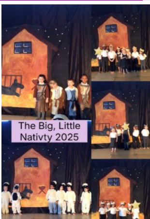
The Big, Little Nativity 2025