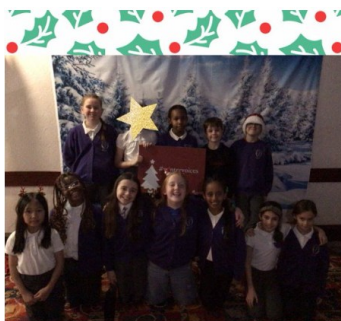
Winter Voices 2025