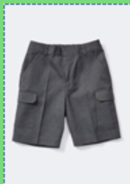
Grey school shorts