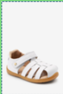
White school sandals