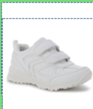
Plain white trainers