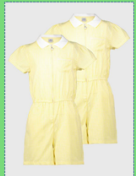
Gingham shorts suit