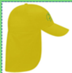
School summer hat