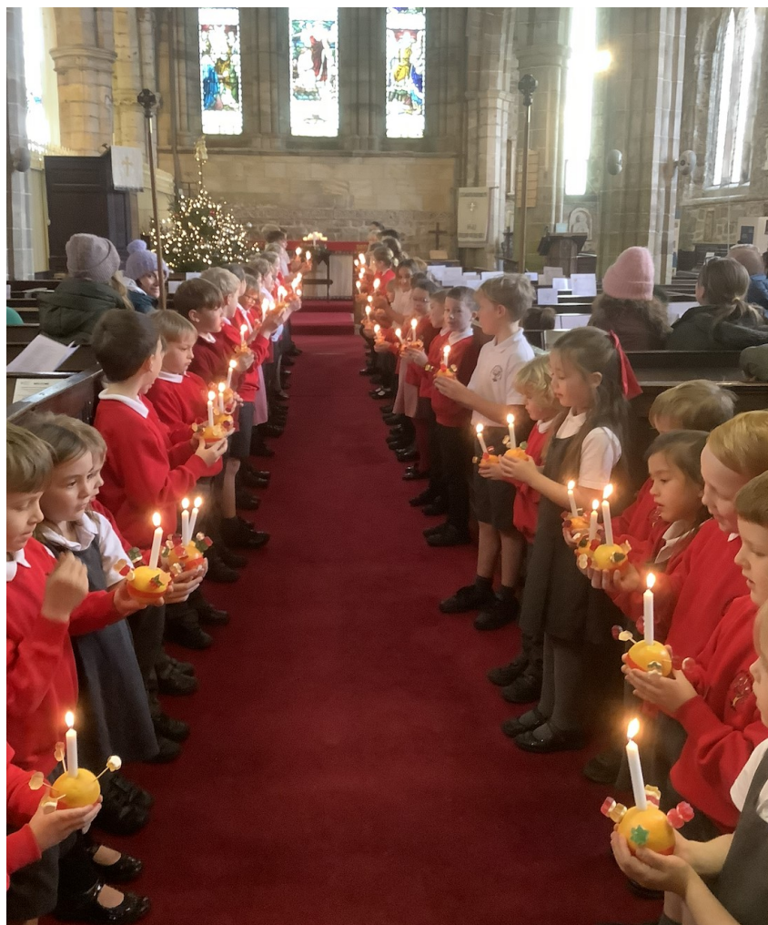
Pictures from our beautiful Christingle service this morning and from Panto earlier in the week