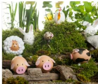
Roots to grow...wings to fly.