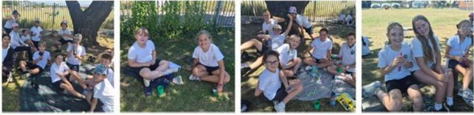
Year 5 continued