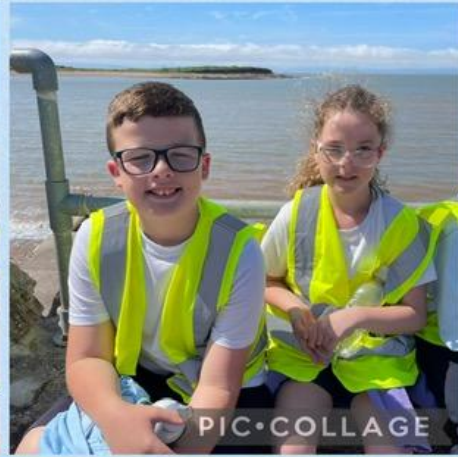
Year 6 Continued