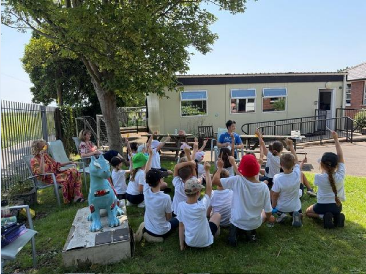
Year 4, enjoying learning Mandarin in the shade, with a refreshing ice lollies! Thank you PTA.