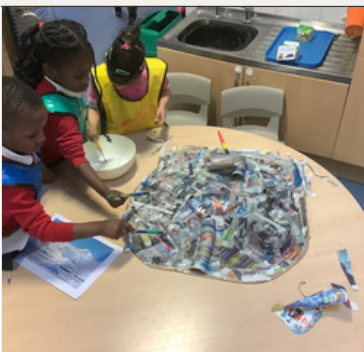
Working together to make our own paper mache Arctic small world