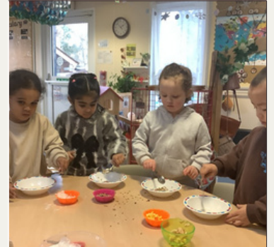
Helping our feathery garden friends with homemade bird feeders