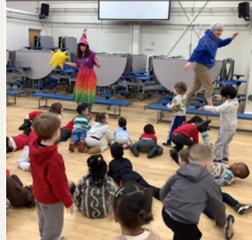
Meeting Jack Frost and Suzie Springtime