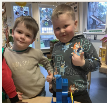
Building enclosures for polar bears