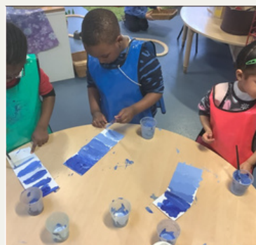
Looking at cold colours and mixing our own shades