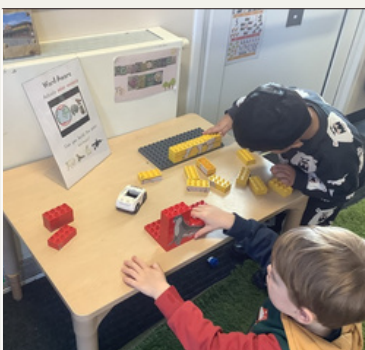
Finding out which animals live in polar regions