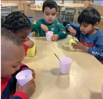
Making hot chocolate after learning about winter

This half term, squirrel class have been considering 'Where can I find snow?'. It's been the perfect weather for thinking about winter and snowy places and as we draw to the end of the term, here are just a few things we have gotten up to on our Arctic Adventure journey so far.