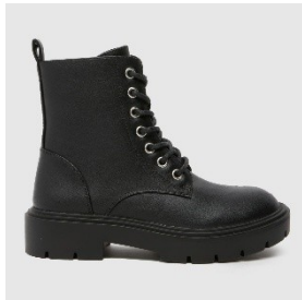
High boots (not suitable)