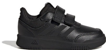
Adidas Tensaur style (acceptable)