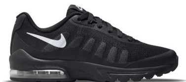
Visible air bubble (not acceptable)