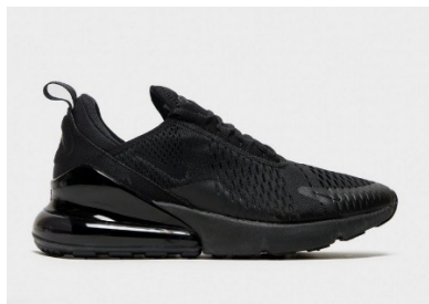
Trainers (not acceptable)