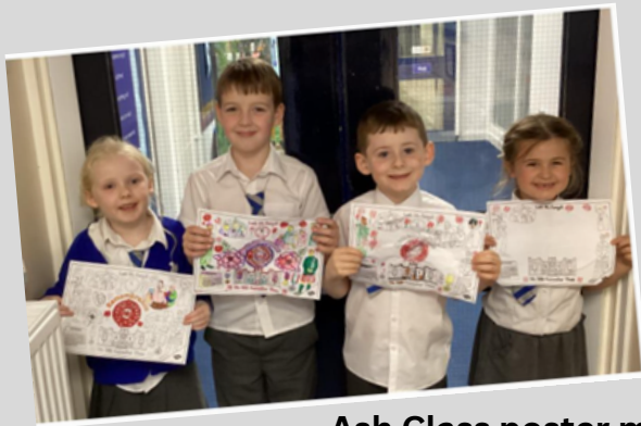
Ash Class poster making