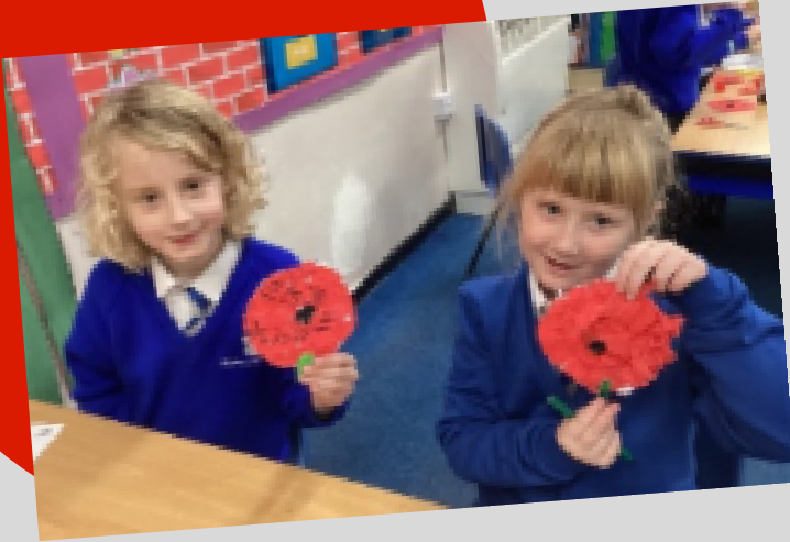
Poppy making in Maple