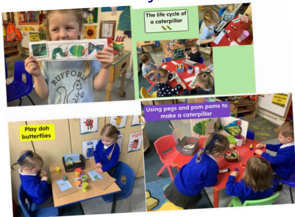
The Very Hungry Caterpillar in Little Squirrels A caterpillar makes a cocoon! – Finley