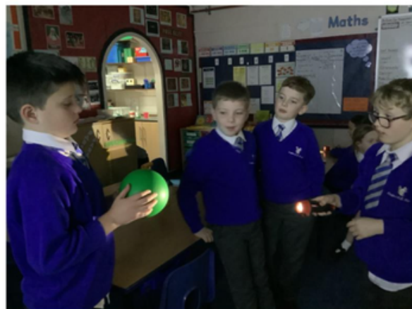
Exploring night and day in science