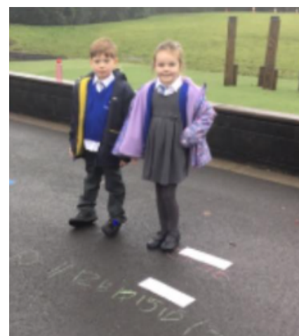
Number line fun!