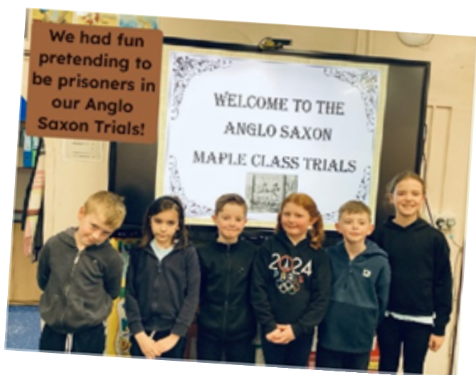
Trial time in History!