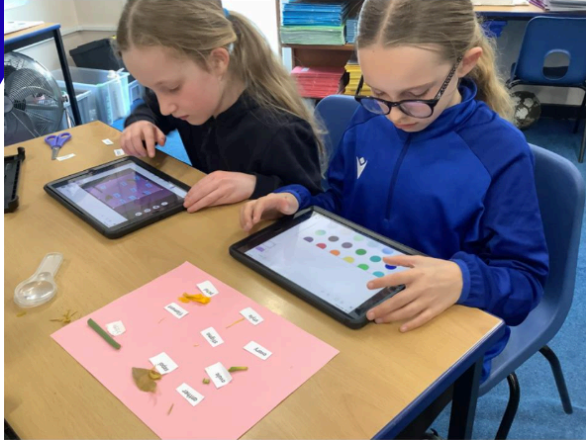
Recording our own learning