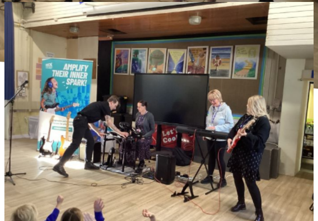
Teachers and pupils rocking it out!