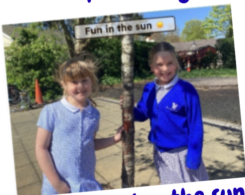
Enjoying the sun