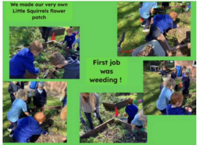
Celebrating Earth Day!