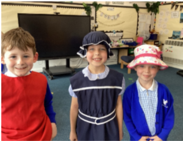
Learning all about the Victorian seaside!