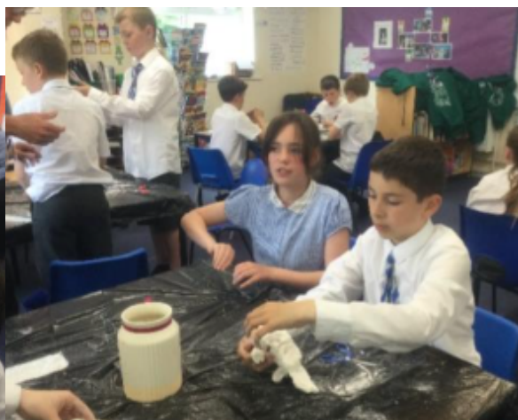
Using Modroc to cover our wire frames we formed of animals or people; we were copying the style of Alberto Giacometti.