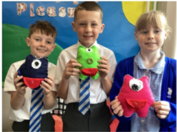
Super Sewing in our DT topic