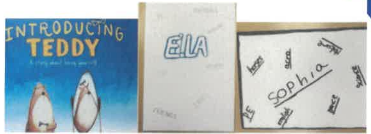
Celebrating the courage to be ourselves