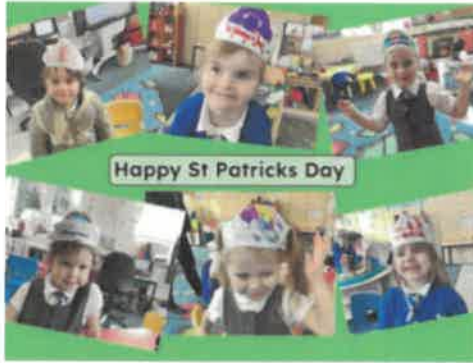
Happy St Patrick's Day!