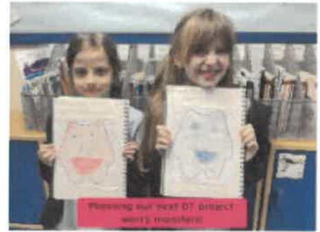
DT project planning