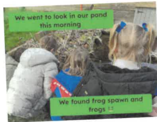
Signs of spring!