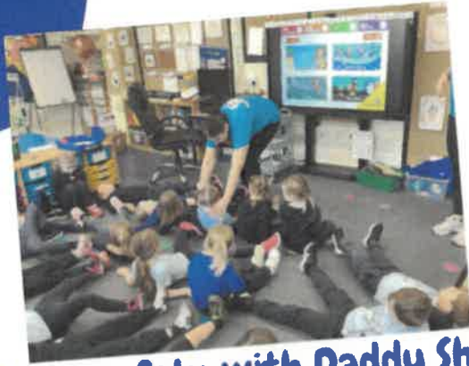
Water safety with Daddy Shark