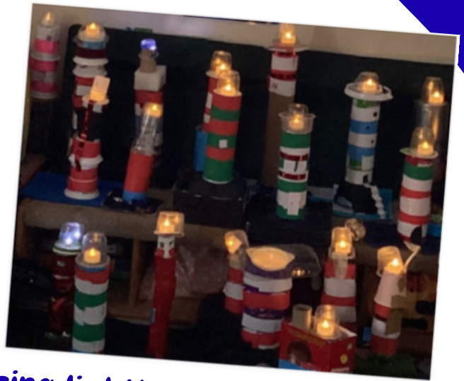
Amazing lighthouses from Ash Class