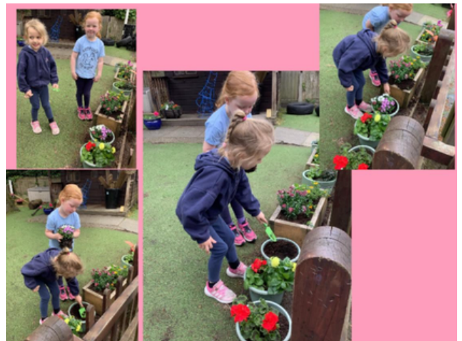
Rufford is blooming!