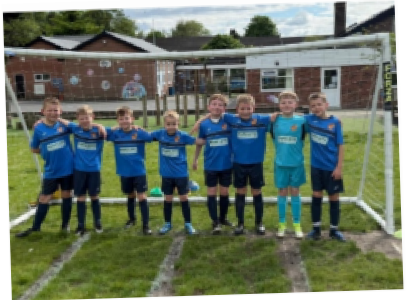
Great team work in a football friendly!