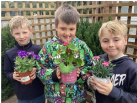
Loving life planting!