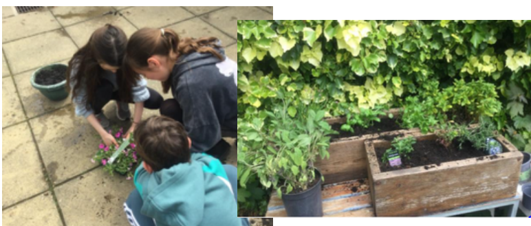
Our new community herb garden!