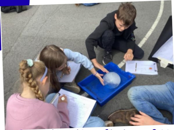
Investigating States of Matter