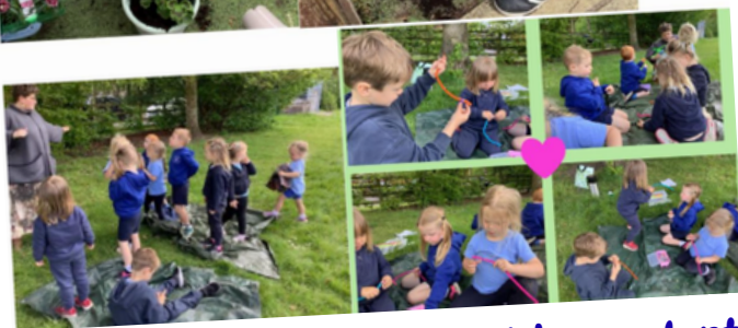
Little Squirrels enjoy outdoors planting!