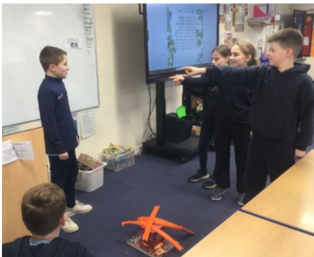
Drama to reflect the Easter story