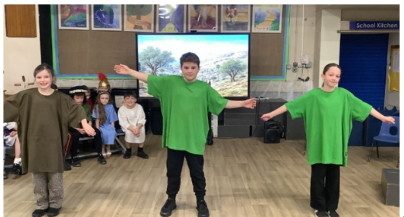
The Three Trees performance