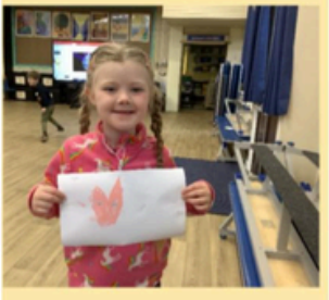
Reflections of Easter