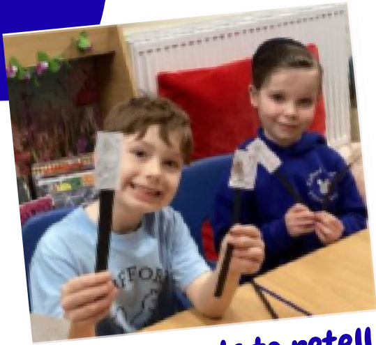
Making puppets to retell the denial of Jesus