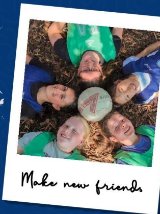
Make new friends