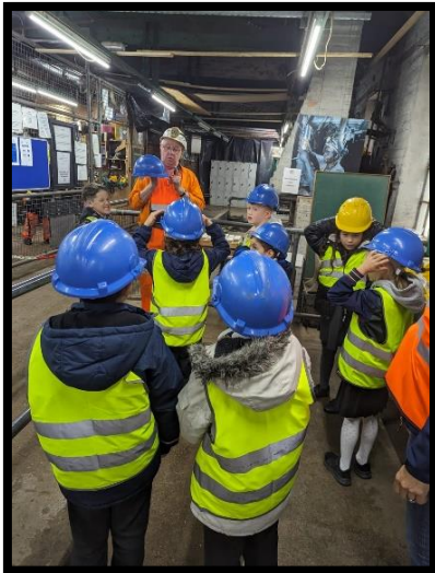
National Coalmining Museum St Andrew's class have had a fabulous time today at the National Coalmining Museum.