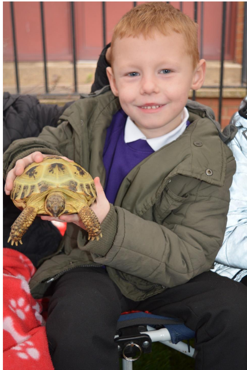
The Farm Visits Year 1