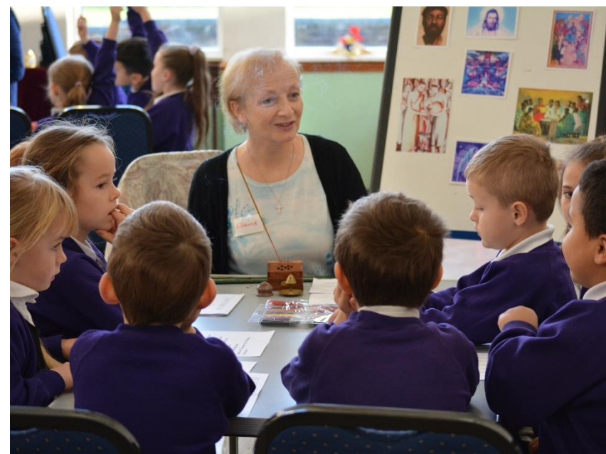
Activity Days at St Augustine's Church