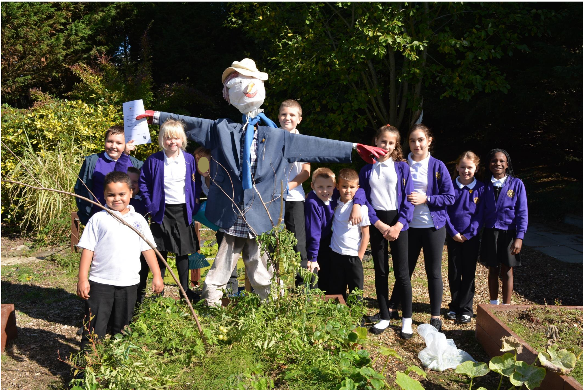
Dunstable in Bloom – Highly Commended