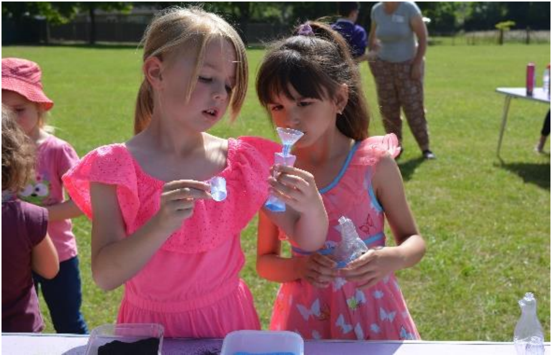
PTFA Summer Fair