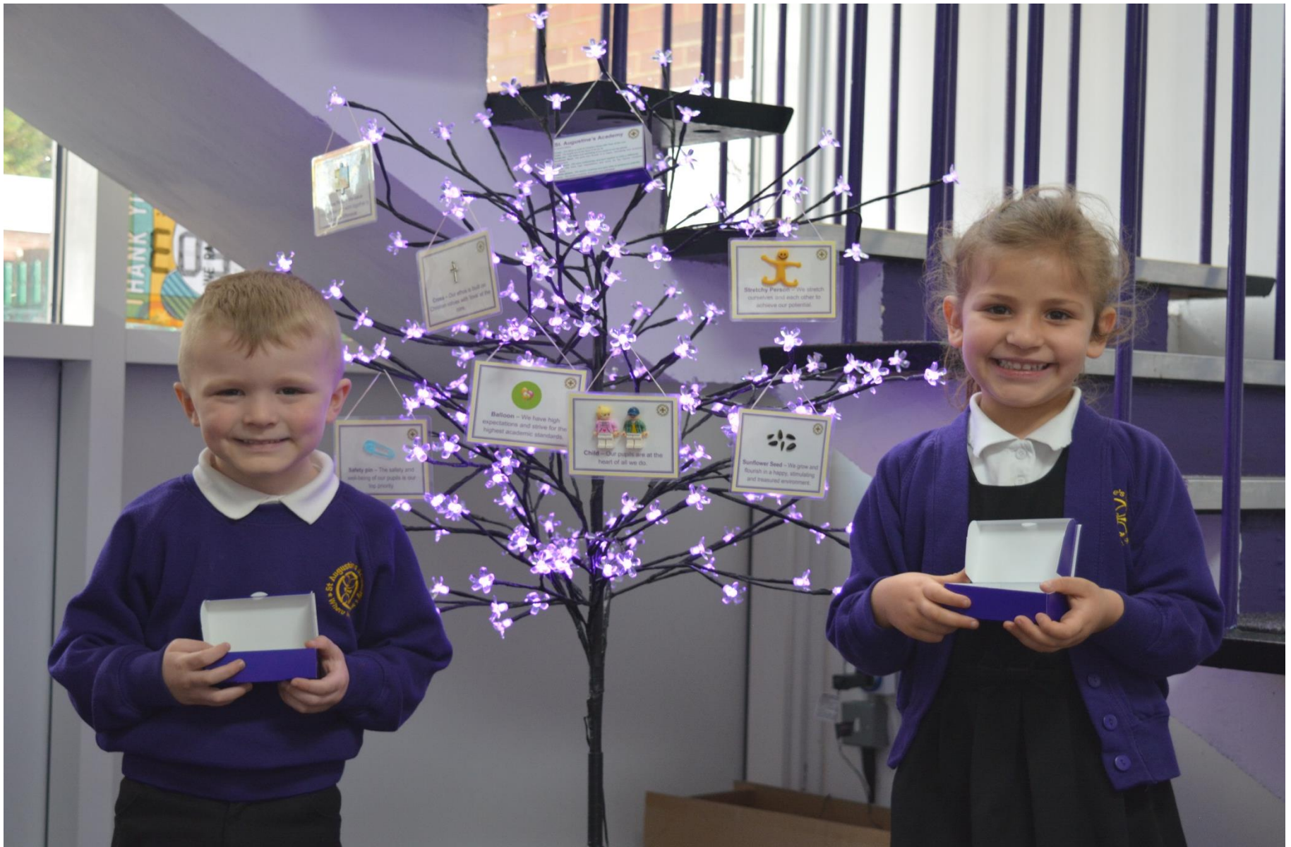
School Vision Tree