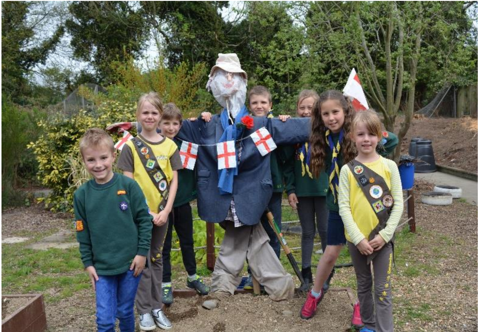
St George's Day