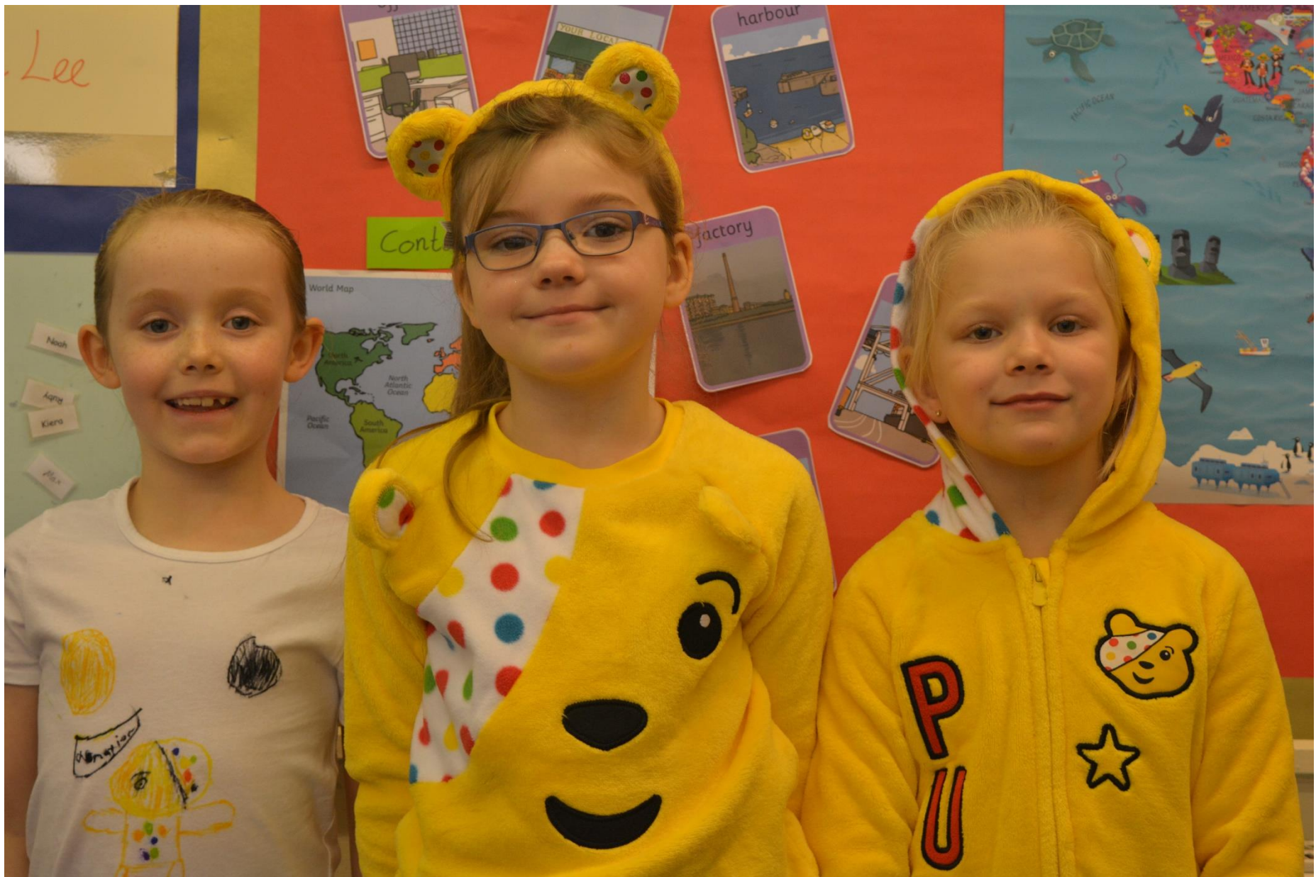
Children in Need