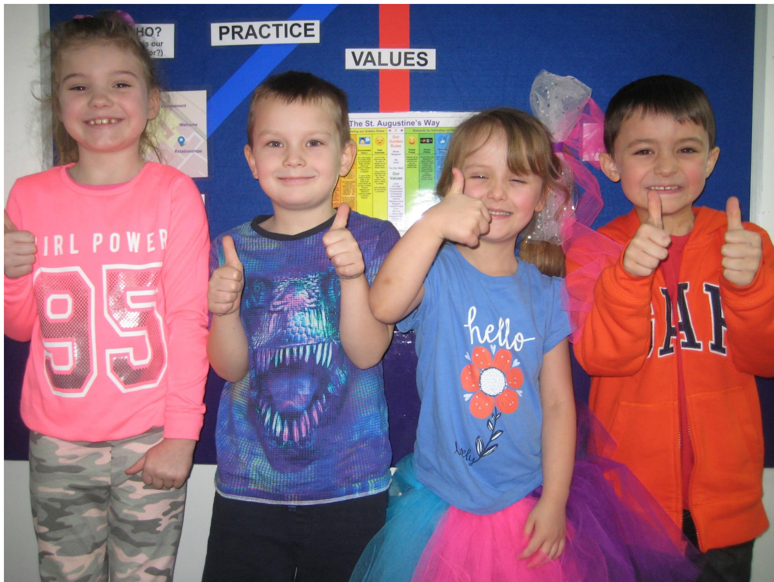
'Shine Bright, Wear Bright' CHUMS Mufti Day