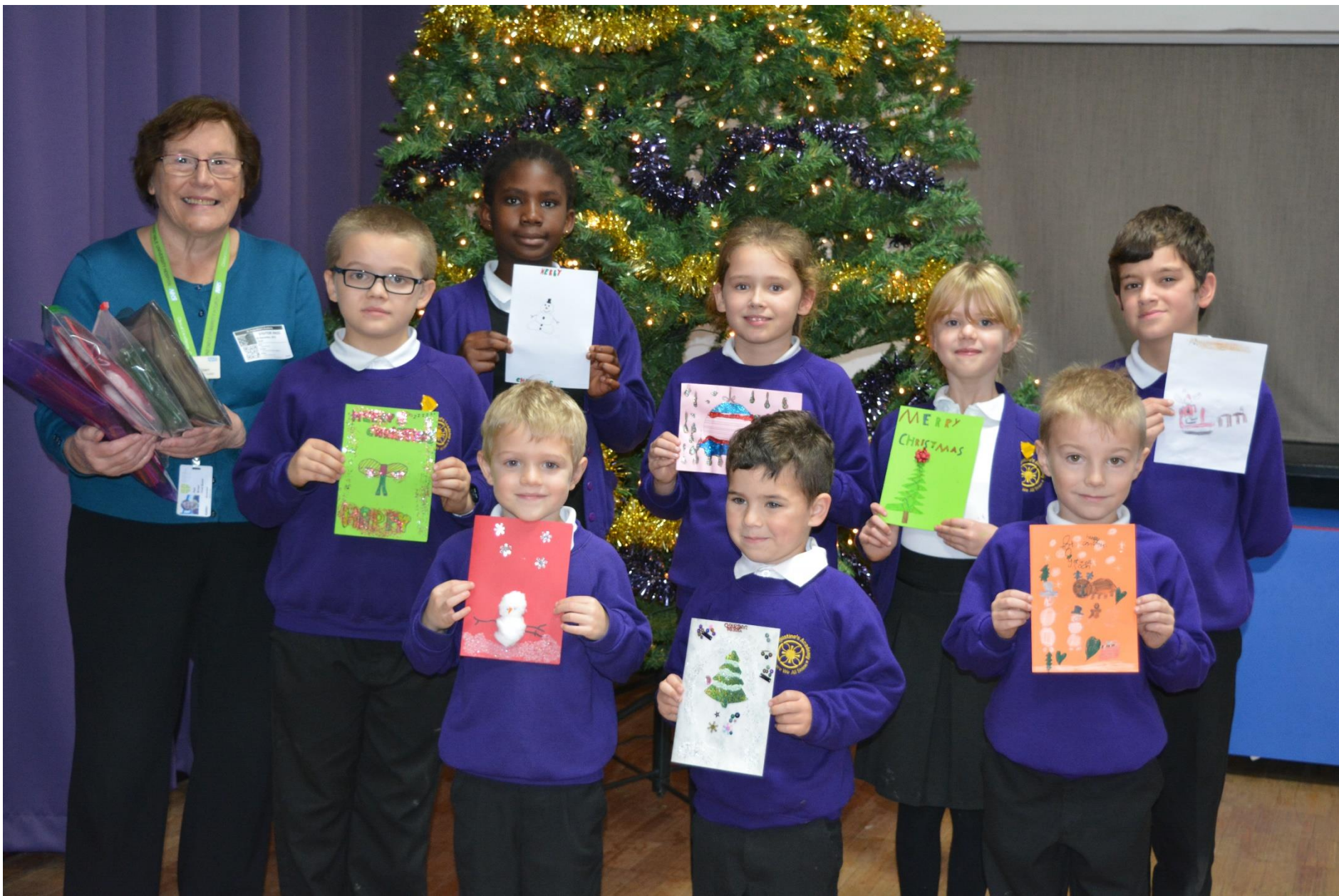
Christmas Cards for Luton and Dunstable Hospital Patients