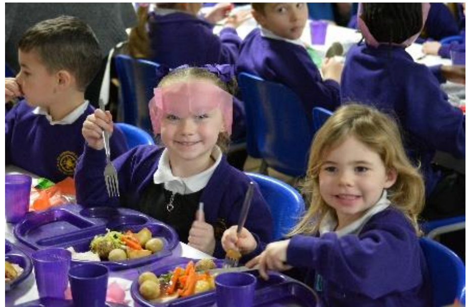
Christmas – A Special Time of Year