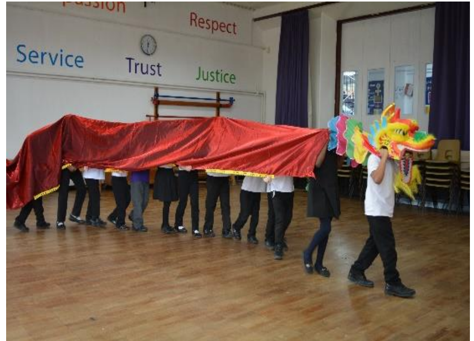
Year 1 Chinese Workshop