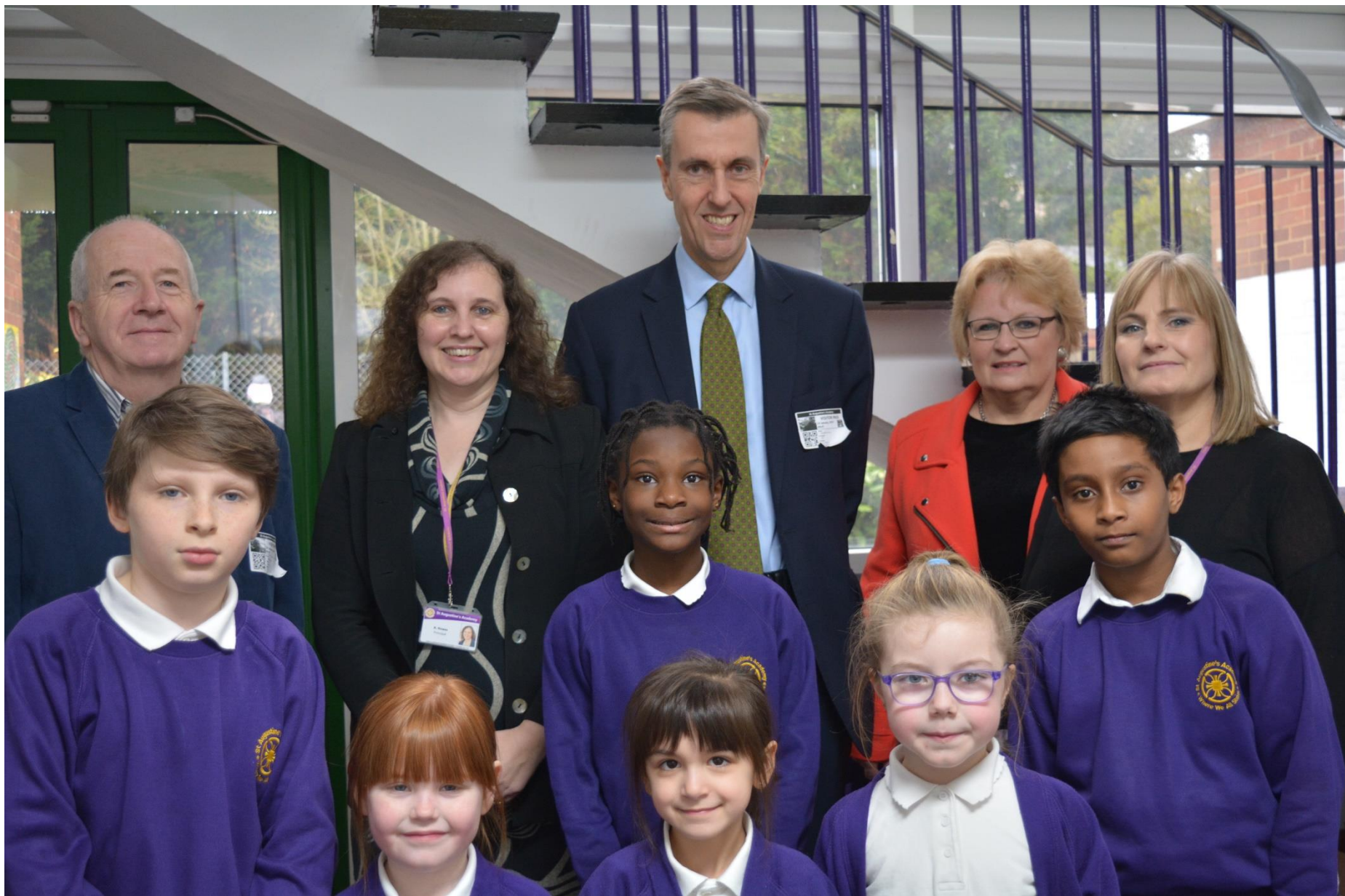
MP Andrew Selous Visit