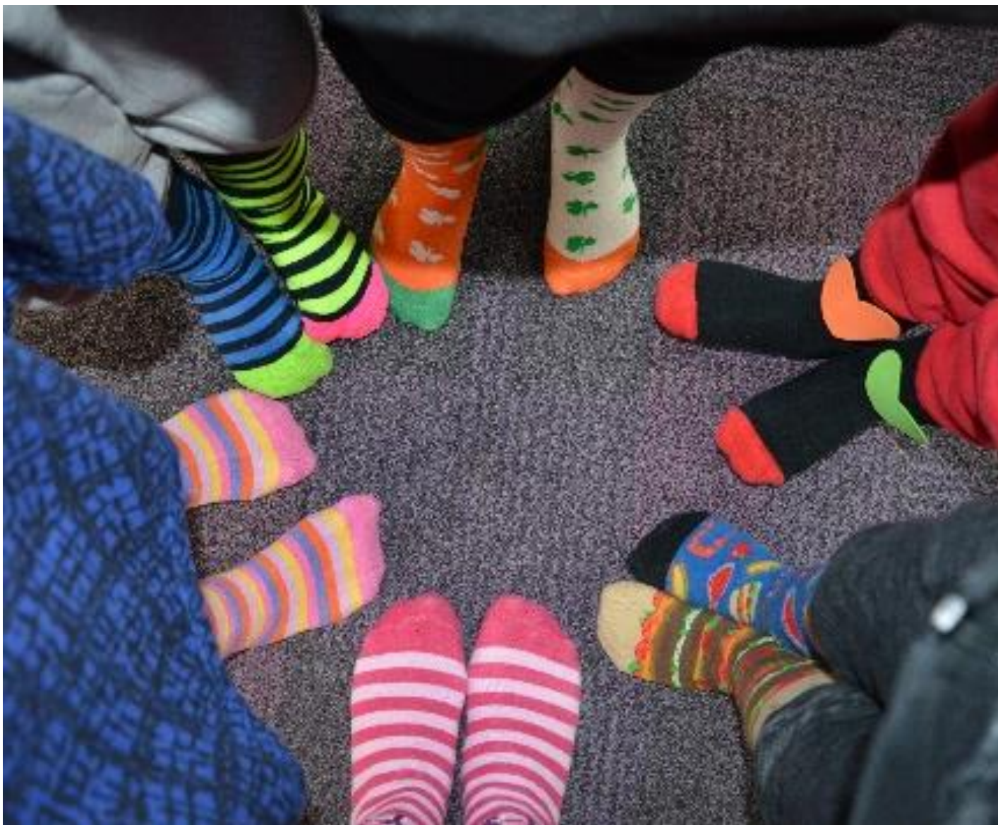
Autism Awareness Week – Silly Socks Mufti Day