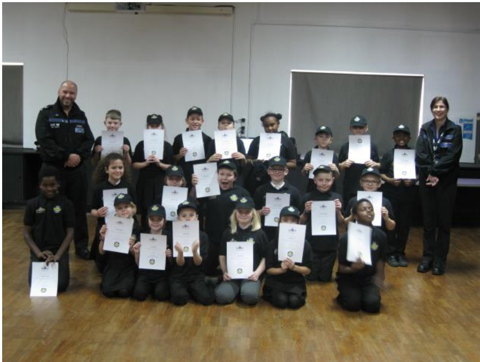
Year 5 Junior Police Squad