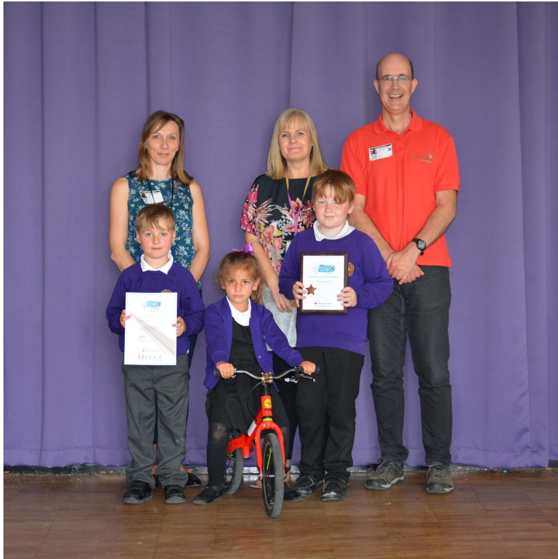
Modeshift Stars Bronze Award First School in Central Bedfordshire to Achieve This!