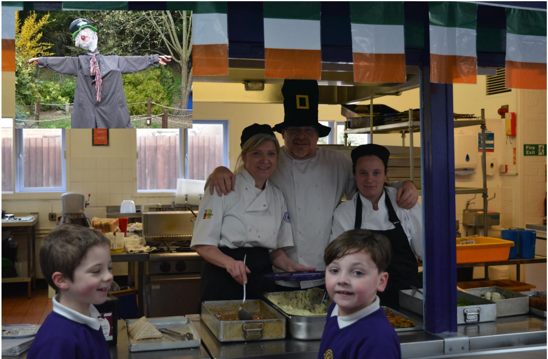
Themed Saints Days