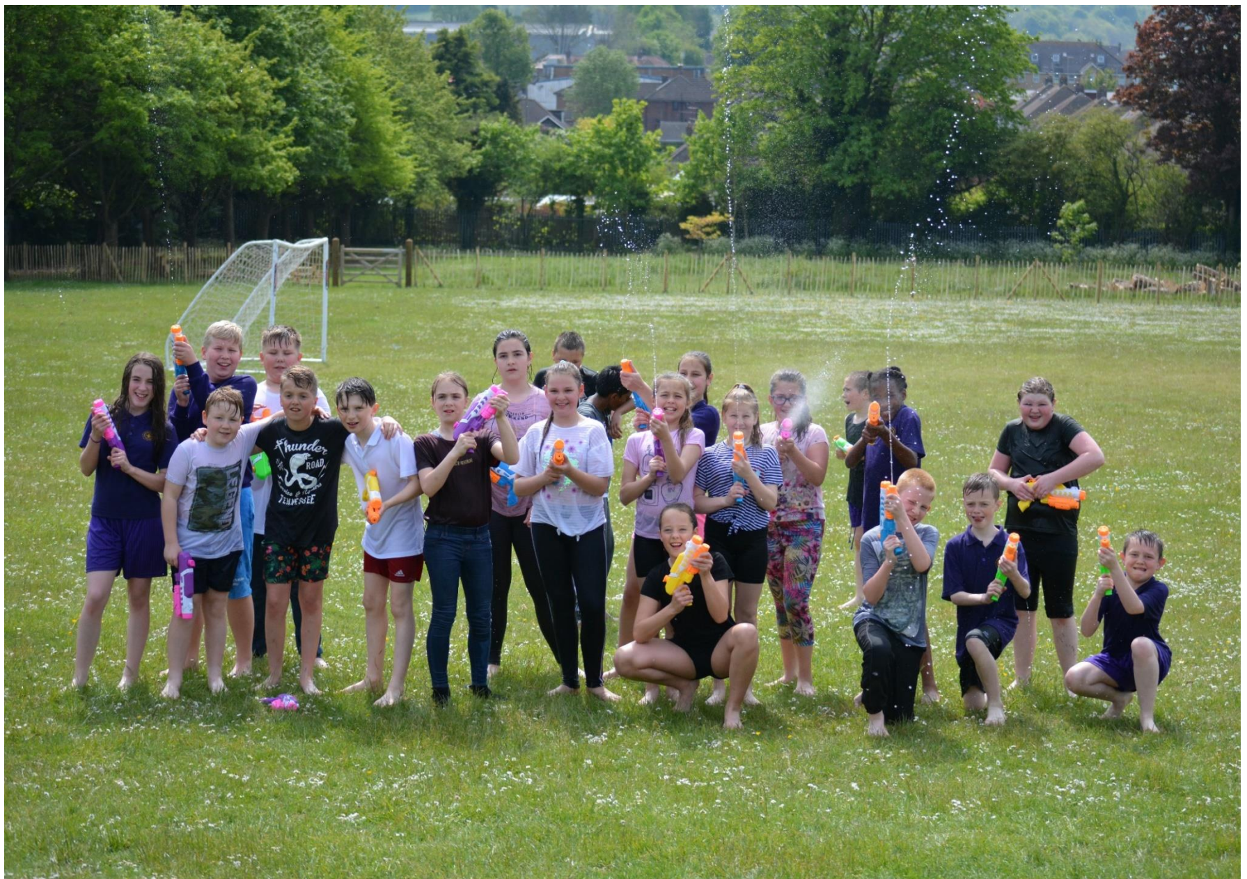
End of SATs Fun