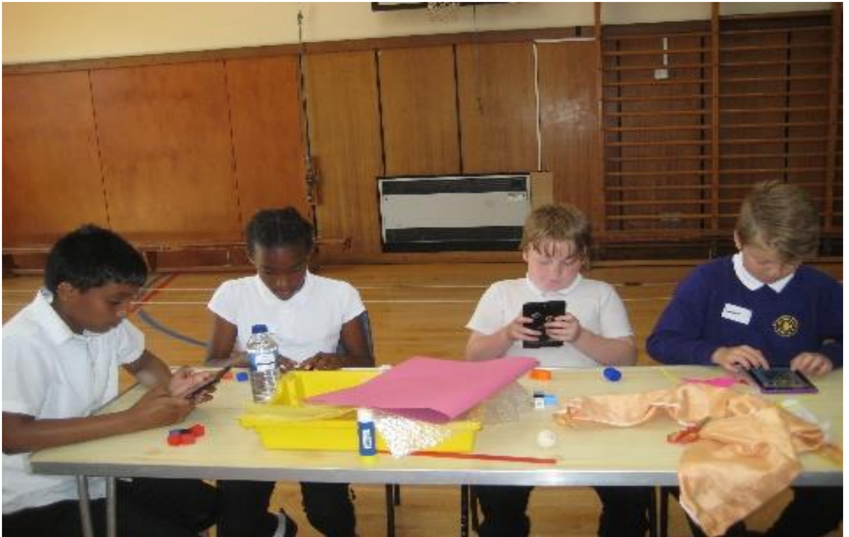
Times Tables Challenge