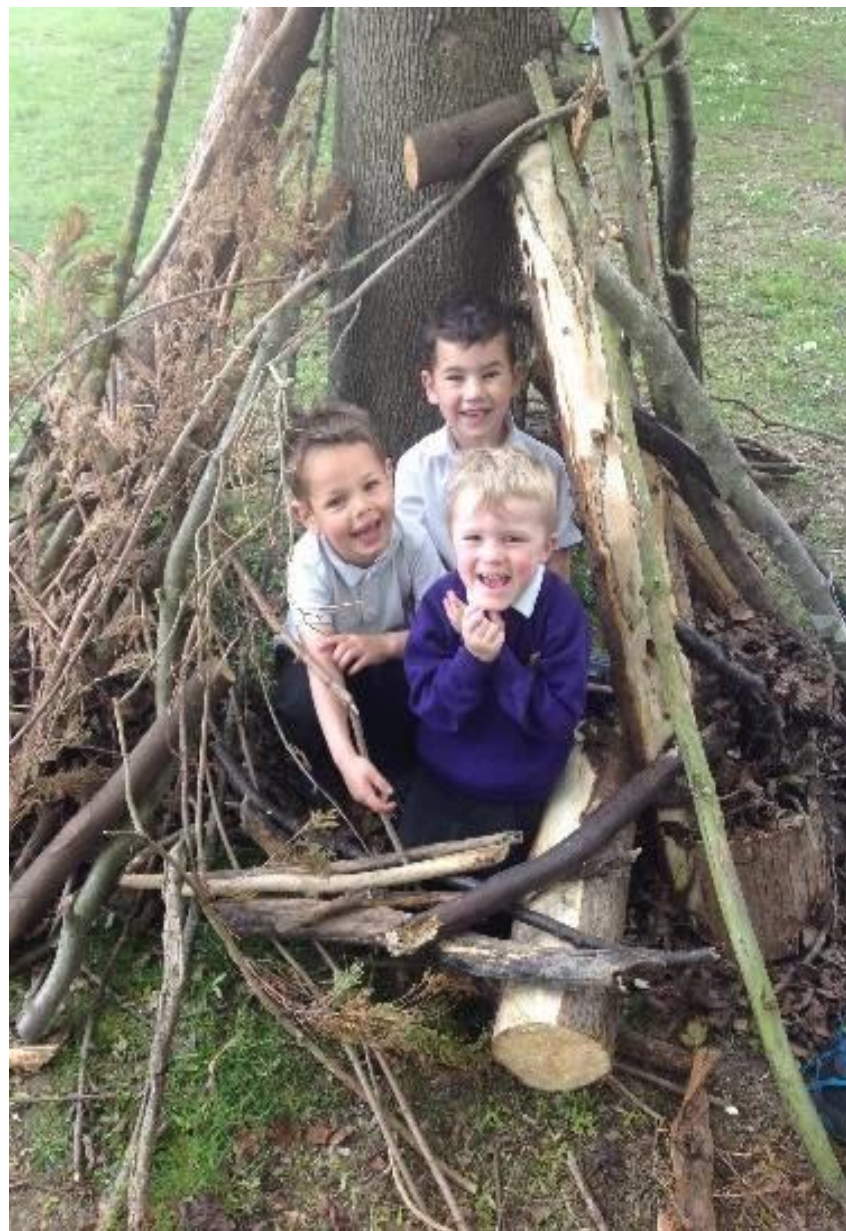
The 'Hello' Project and Forest School