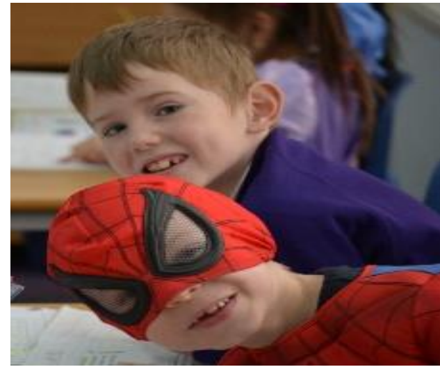
World Book Day