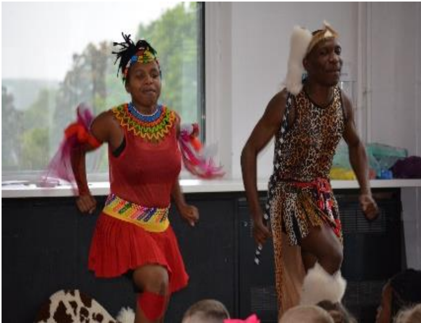
Mighty Zulu Nation