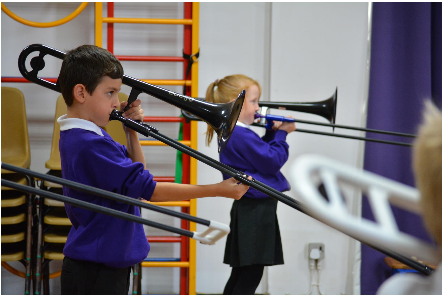
Learning to Play Musical Instruments