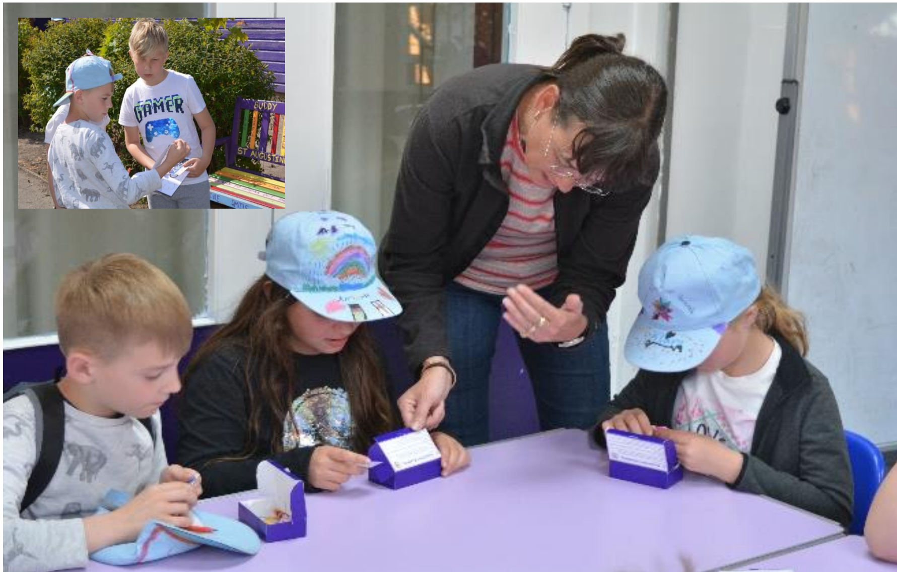
Our German Friends Visit